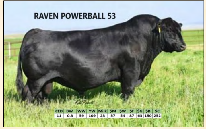
Sire to Lot's 11 and 53