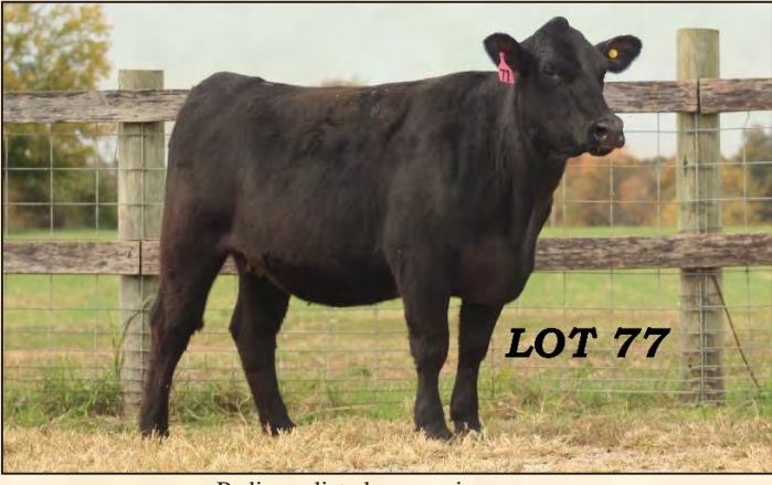
Pedigree listed on previous page.

Nice bred heifer was pasture exposed to from 12/24/2022 to 4/17/2023 to MR THF GUS (3670622) examined safe with calf.