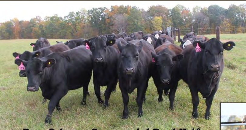
Barr 3 Angus Commercial Bred Heifers