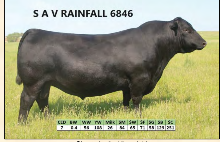
Sire to Lot's 15 and 18