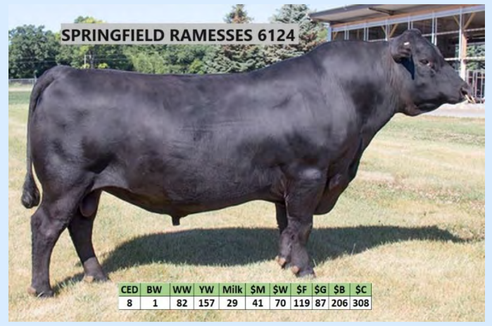
Sire of Lot's 1, 2 and 13

with a pair of Ramesses sons. Both of these bulls excel for calving ease and growth. The Lot 1 bull had the highest daily gain of all the bulls in the sale at 4.02 lbs. per day. Don't overlook the Lot 3 bull out of Patriarch, he is one of my personal favorites in the sale. Lots 4 through 6 are an exceptional set of Growth Fund bulls. As you look through the bulls, I think you will agree they are a really nice set of bulls with some really good numbers to back them up. We have several good cow-calf pairs along with some spring bred heifers in the sale. Most of the females are out of the leading AI sires in the Angus breed and several have AI calves by their side. These are cows right out of the heart of the herd. There are 10 pairs of first calf heifers along with several second calf cows. Thanks, Wayne & Gary Johnson