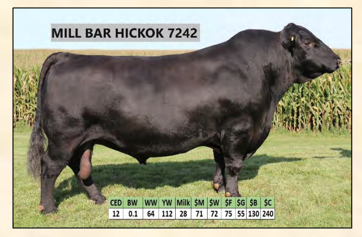
Sire to Lot's 12, 47 and 82. Grandsire to Lot's 1 and 10.

All Bulls have Genomic Enhanced EPD's All Bulls have Passed a Current BSE All Bulls have A Negative PI & Johnes' Test All Bulls have been Vaccinated and Dewormed. All Sim-Angus Bulls are Homozygous Black View videos at www.DVAuction.com