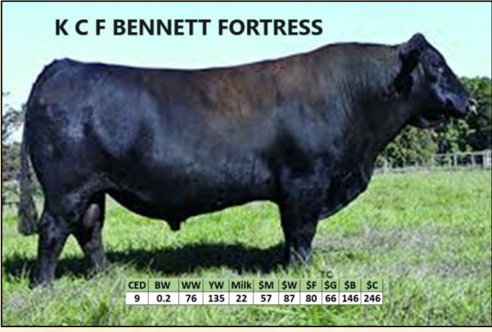
Sire to Lot's 61, 64. 66. Grandsire to Lot 12

Good luck, and happy bidding. Patrick Gunn, ISU Extension cow-calf specialist