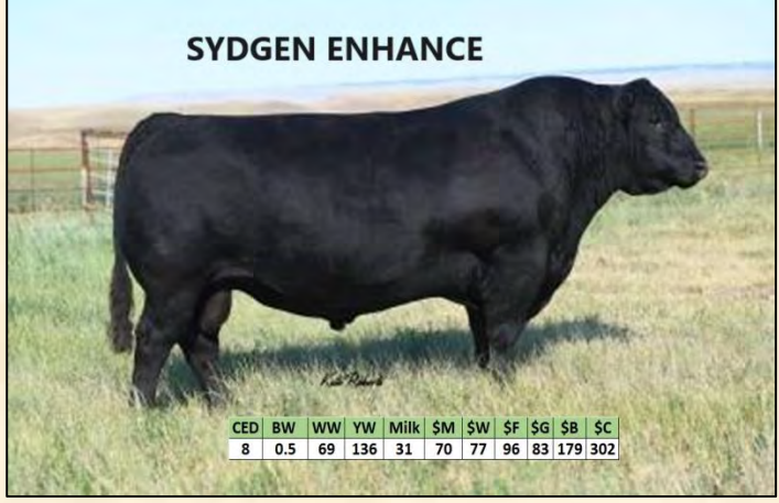
Sire to Lot's 9, 48, 54, 56, 65 and 67. Grandsire to Lot's 2 and 45.

AI Sired by Kesslers Commodore 6516, this nice bred heifer was pasture exposed to MRA Rainmaker Prod 1619 from 4/29/2023 to 7/29/2023 and should be about 4 months based on vet examination.