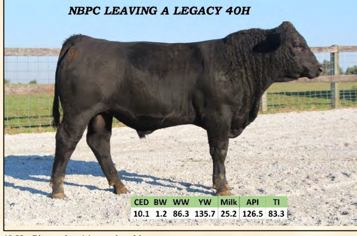
40 H - Pictured at 14 months old.

We raised Legacy 40H , he is sired by the W/C United 5C bull we purchased from South Dakota. He has 4 sons in this sale. Lots 24, 34, 42 and 44.