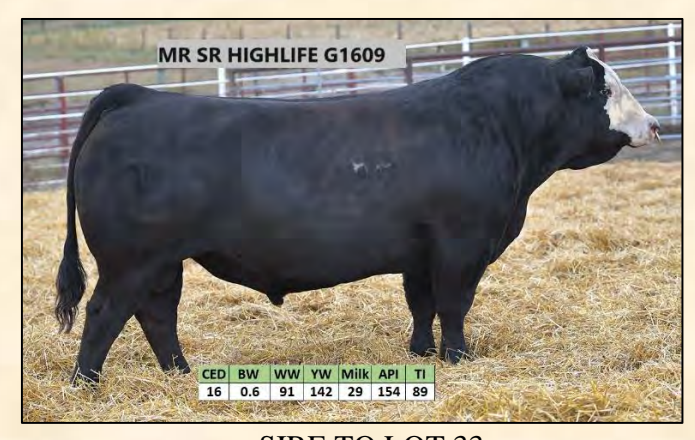
SIRE TO LOT 33

Don't over look this young man. He is the youngest bull in the Sale. He Qualifies for KY and TN Cost Share.