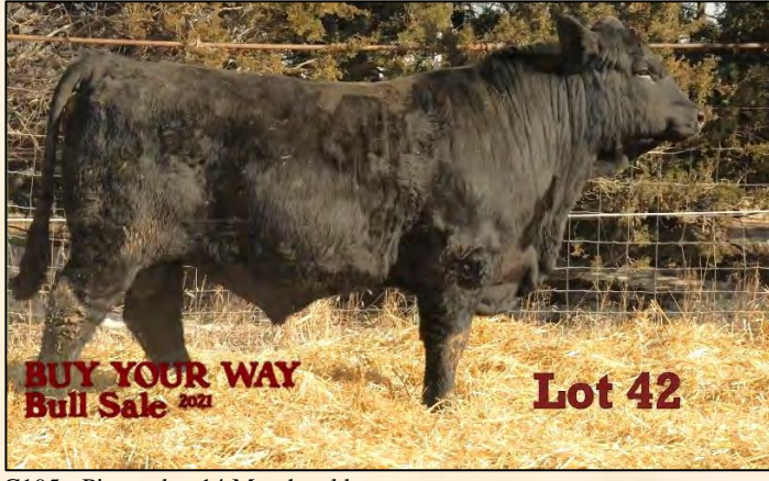
G195 - Pictured at 14 Months old

We purchased HSF Kansas G195 from Hofmann Simmental Farm's in Clay Center, Kansas on March 6<sup>th</sup>, 2021. He is an excellent addition to our breeding program. He has 6 sons in this year's sale, Lots 30, 31, 36, 37, 41 and 43.