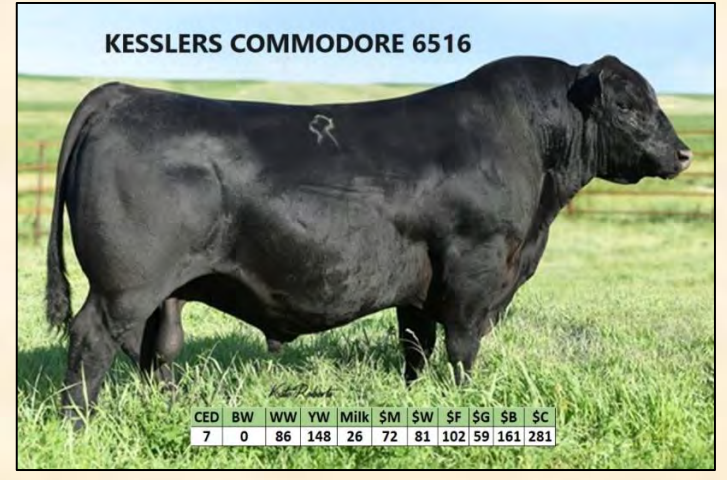
Sire to Lot's 52 and 84